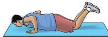
Push-up with a plus