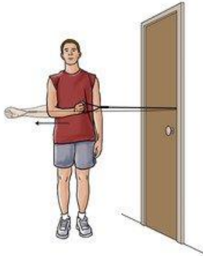
Resisted shoulder external rotation